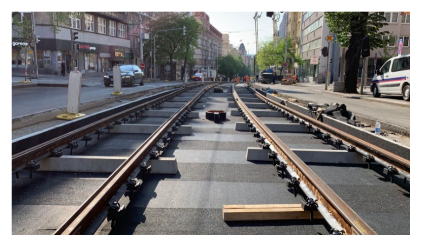
Figure 3: Tram rails NT1 (ČR), company Transport Company of the capital city of Prague