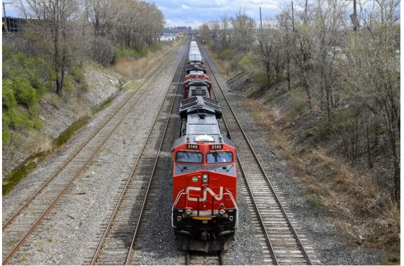
Figure 1: 136RE broad gauge rail (Canada), Canadian National Railway Company

The rails are generally used by railways including underground, tramways, industrial and mining railways. The rails, together with sleepers and small rails, form the trackbed. The rail field in the track bed forms the railway superstructure.