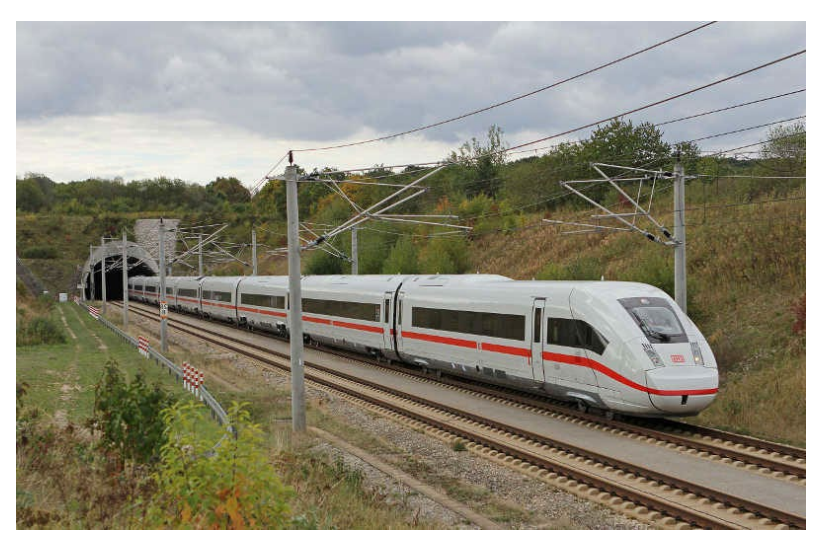
Figure 2: Broad gauge rail 60E2 (Germany), Deutsche Bahn